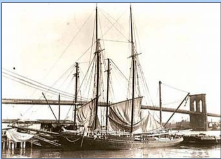
The Saban Schooner Esther Anita in the New York Harbour with the Brooklyn Bridge in the background, photo taken in 1915.