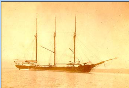
The Schooner Phineas W Sprague. A 1910 New York Times article wrote of her when she was overdue. The Sprague came into port like a ghost of the sea. Torn sails, rigging carried away, and the scars left along her sides by the storm told the story of the fight she had made.